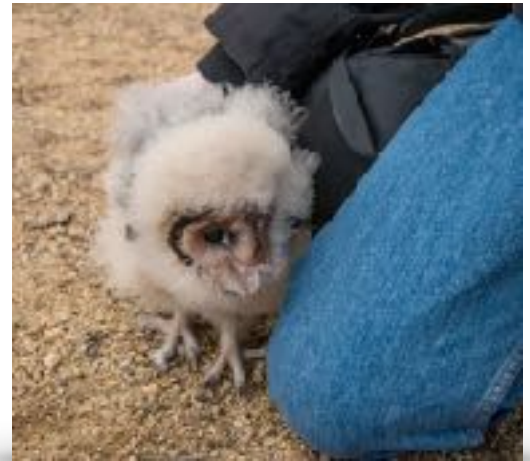
Masked Owl chick

The Brown Goshawk flew into the pine trees at the edge of the paddock, wonderfully camouflaged in the foliage; only movement betrayed its presence until it perched in the sunlight. Bush birds would steer clear of this swift, highly manoevrable raptor, but made a great portrait perched on the arm of the handler.