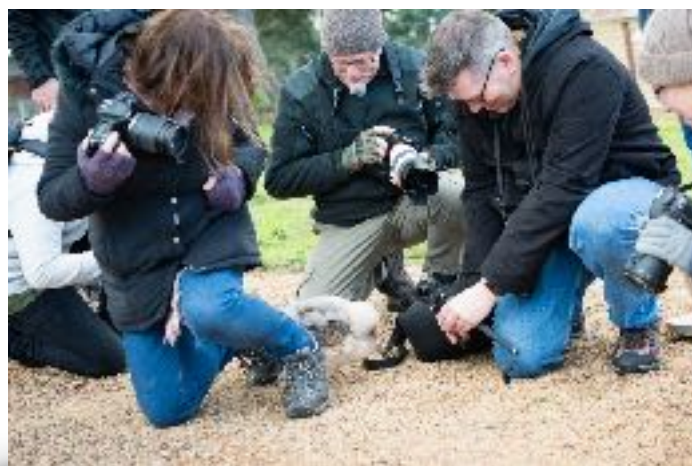
Masked Owl chick trying to hide between feet