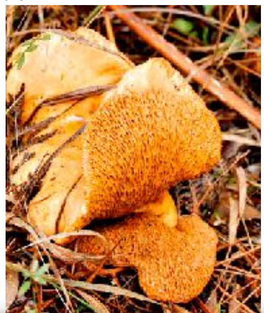
Tricholomopsis rutilans Fungi