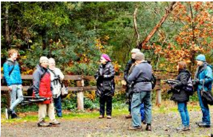
The start of the expedition