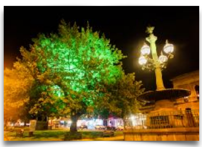
Sturt St Lights - Brett Keating