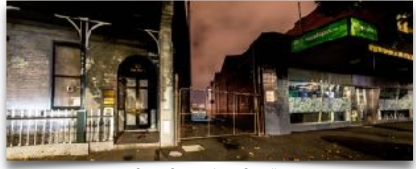
Camp Street - Anne Carroll