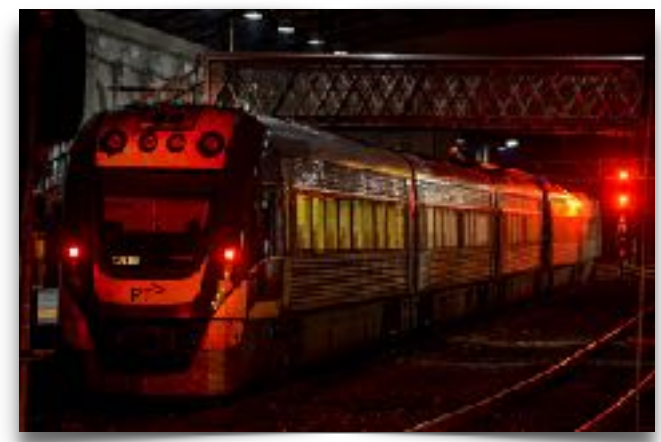
Train in Station Ballarat - Greg Tate