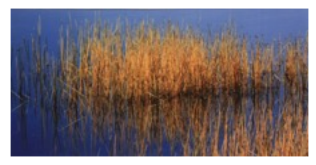
One of Kate Both's beautiful photos