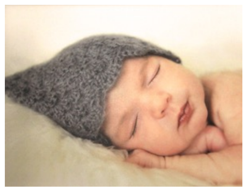
Bec Nicolandos' winning photo