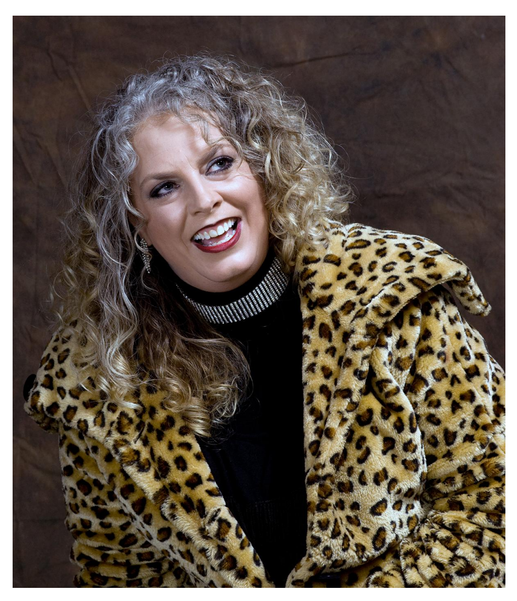
Portrait Photo Workshop Sony DSLR-A900 Minolta 100mm f/2 @1/125 f/9 ISO 200