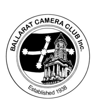
Reg. No. A000 4054F