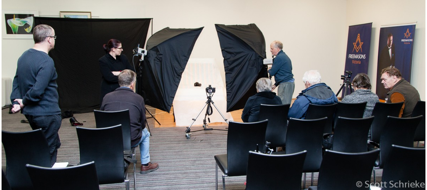
From top left clockwise

Eos 5Dmk2, 70-200mm @ 70mm, f2.8, 1/40sec, ISO400, no flash, handheld. Same with 24-105mm @ 24mm, f4.0, 1/60sec, ISO800, no flash, handheld. Same @ 24mm, f4.0, 1/30sec, ISO800, no flash, handheld. Same @ 24mm, f4.0, 1/40sec, ISO800, ETTL flash on ceiling bounce, handheld.