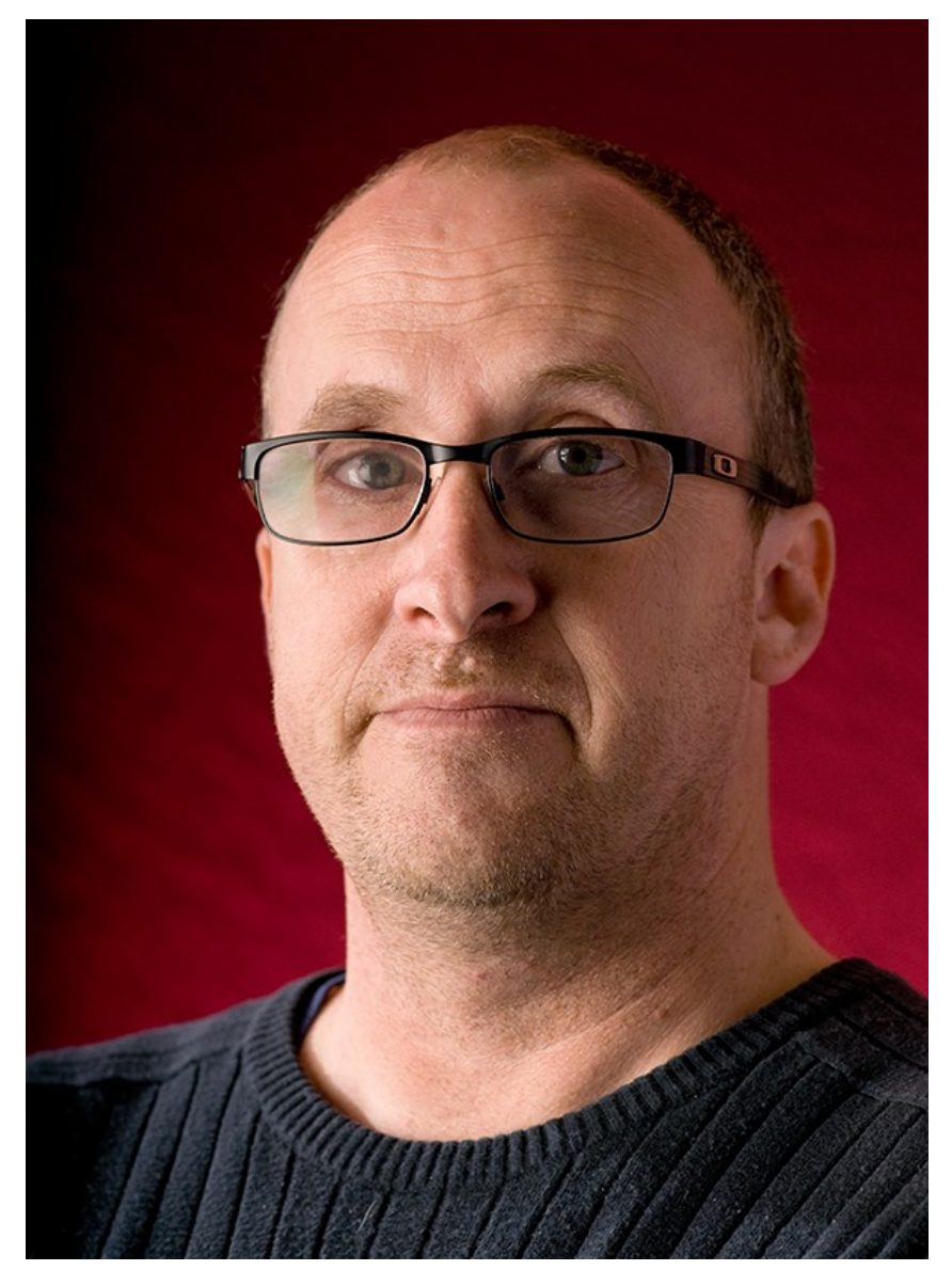
Studio/ Still Life Lighting Workshop "Jamie"

Sony A-900 Minolta 100mm f/2 @ 1/250 f/5.6 iso 200 Manual Mode.