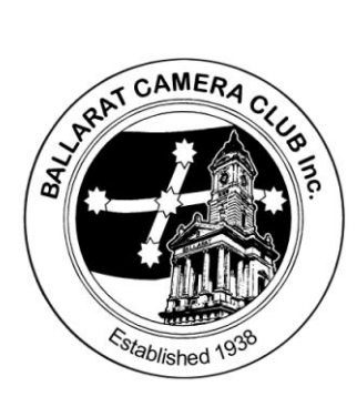
Reg. No. A000 4054F