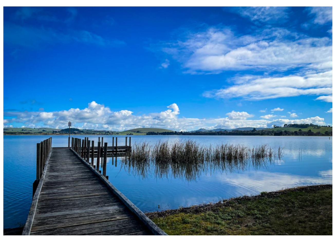
Lake Learmonth