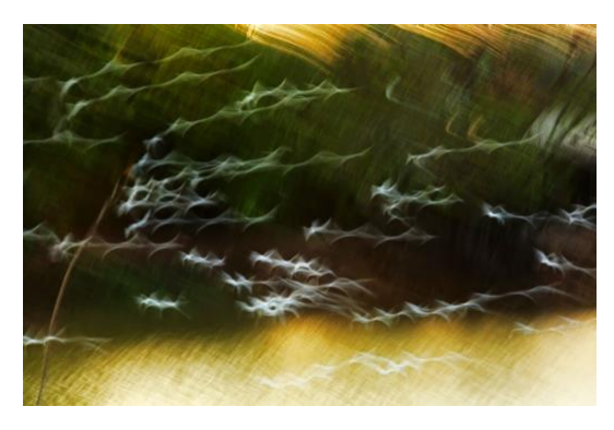
By intentionally moving the camera or taking a multiple exposure, you can transform recognizable landscapes into intriguing abstract images.

Using a shallow Depth of Field, F4 or F5, will give your images a soft dreamy background.