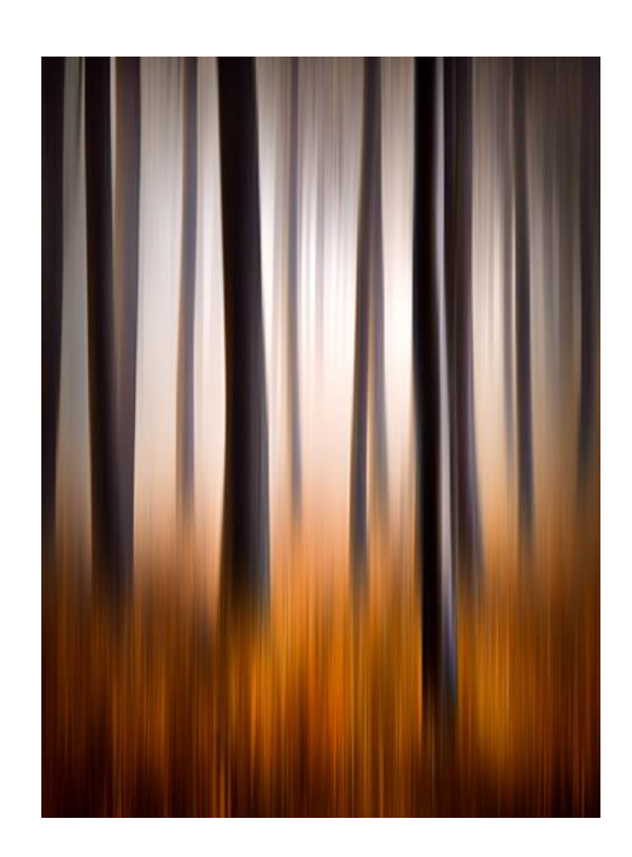
Intentional Camera Movement. While using a longer exposure than normal move your camera sideways, up and down or in a circular motion while the shutter is open.