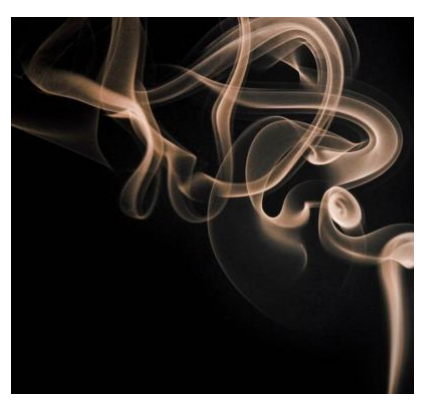
Try taking a photograph of the patterns created by smoke or steam.

As with all photography, lines and shapes can really add depth and impact to your image. Focus your attention on bold, strong shapes such as straight edges and angled corners or anything geometric. Alternatively, you could always opt for a range of organic shapes such as flowers, leaves or pebbles.