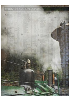
Annuals Night Display 2021/2022