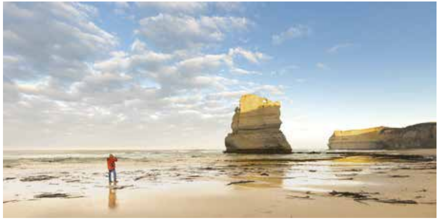
Early Morning