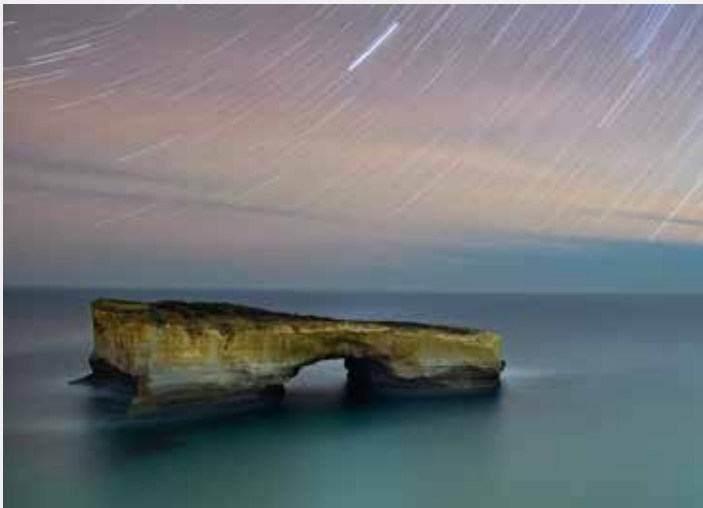
Trails at London Bridge - Frank Carroll