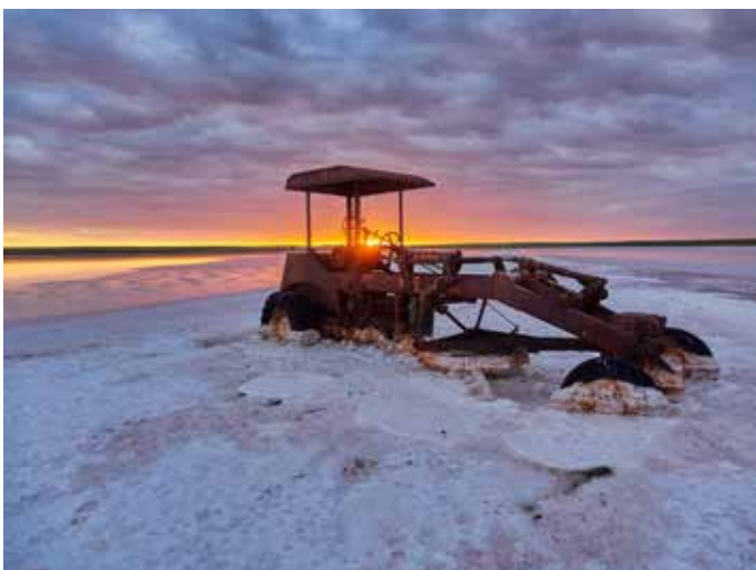
Old Salt Harvester - Mark Bevelander