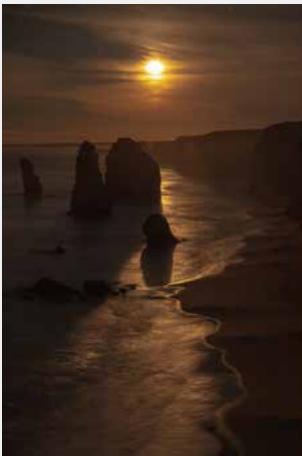
Midnight Moonset at the Apostles