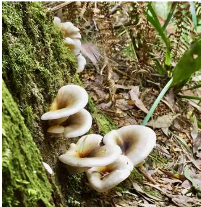
Ghost Mushrooms - Lyn Fowler