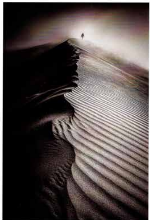
Preston Photographic Club