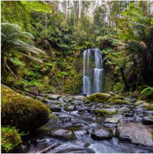
Down Below the Gum Trees - Frank Carroll