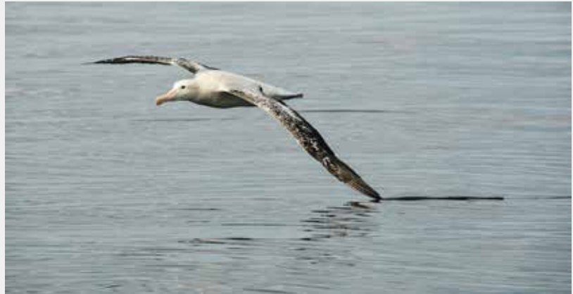
Wandering Albatross - Carol Hall