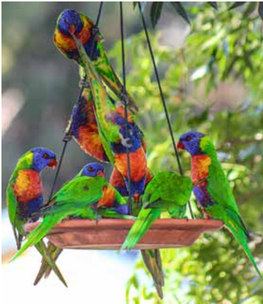
Feeding Time-Sonia Bickley