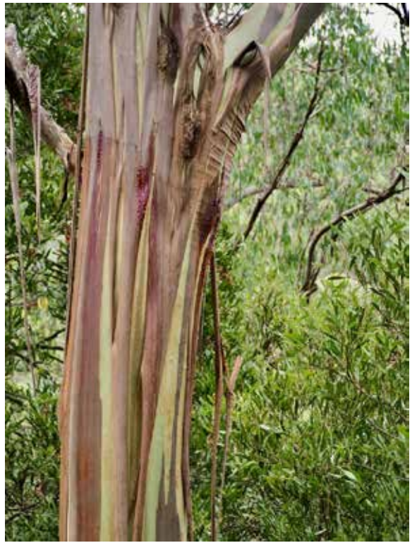
Lyn Fowler - Beautiful Bark