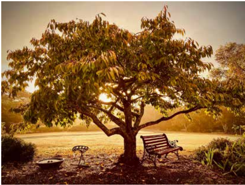
Betty Bibby - Cherry Blossom Tree in the Mist