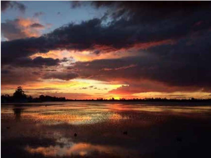
Sonia Bickley - A Sunset Storm