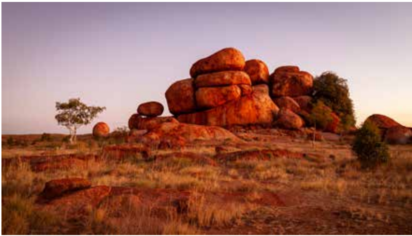
Trevor Bibby - Devil's Marbles