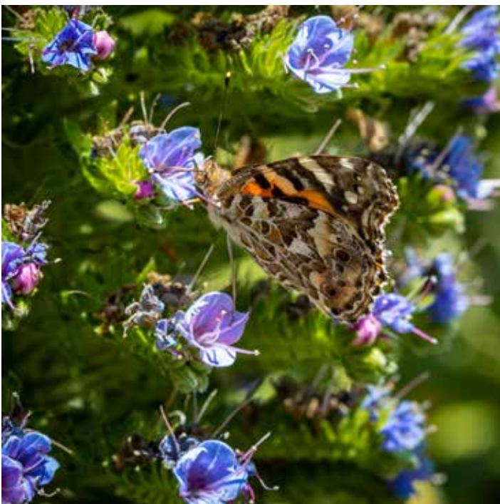
Trevor Bibby - Butterfly Feeding