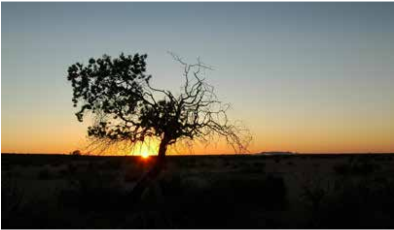
Judy McEachern - Desert Tree