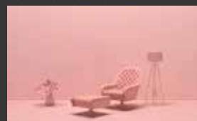
Example of a monochrome with a colour tone