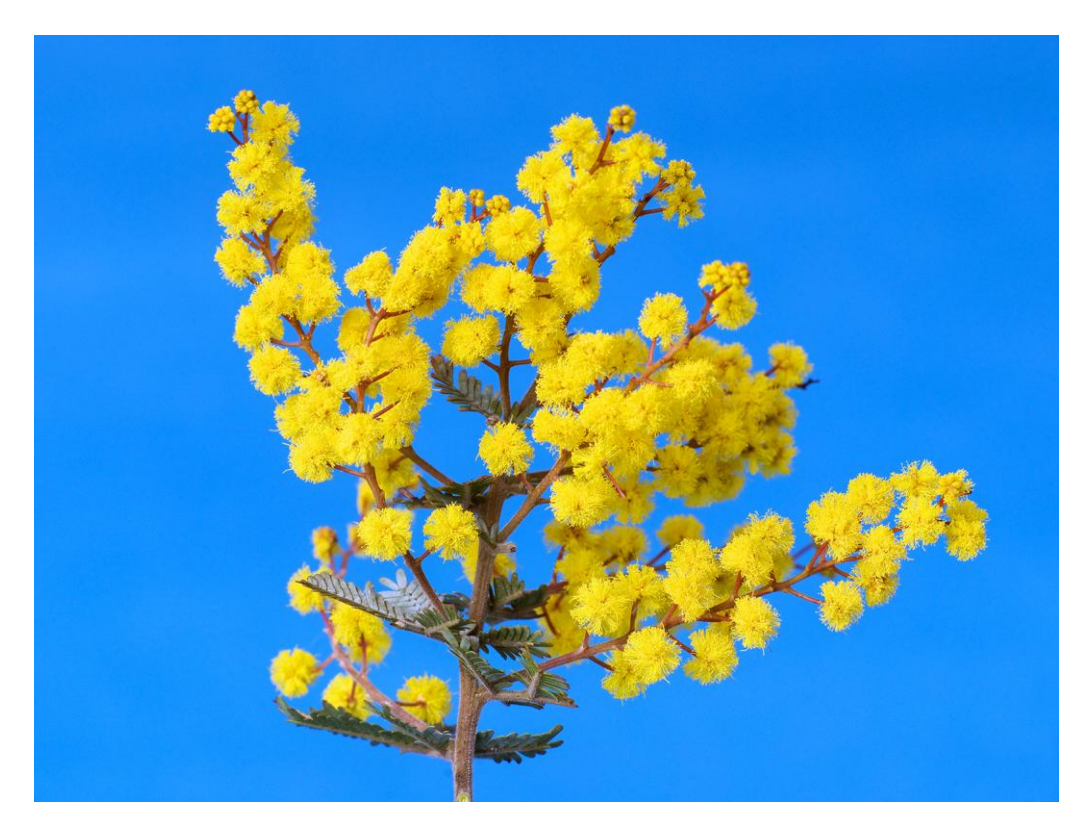
"Wattle" Taken with a Sony A900 200mm f/2.8 + extension @ 1/125 f/22