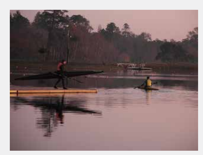
Autumn in Ballarat

t's a strange time that we're all living in now. I'm not sure what you've been able to achieve during the time of isolation, but in my case, I had great ambitions for all sorts of projects but gradually I refined (a word meaning I didn't do them) them to one i.e. organising my photos.