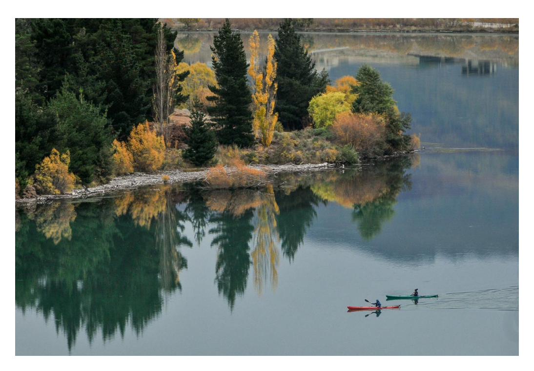
"Cromwell" Image by Carol Hall