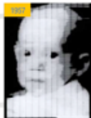
SCIENCE HISTORY IMAGES