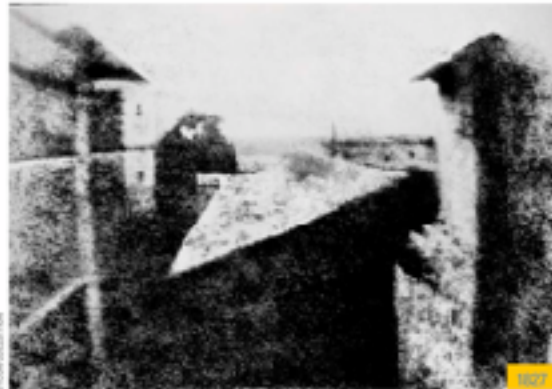
FROM GALLERY STOCK