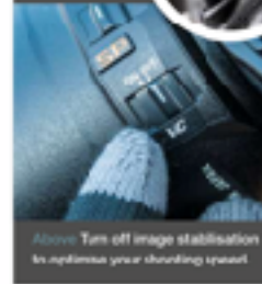
Above Turn off image stabilisation to optimise your shooting speed