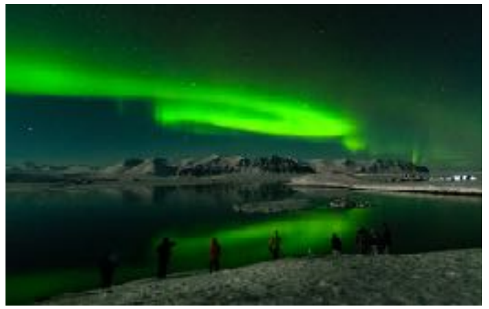
Large Prints - Open