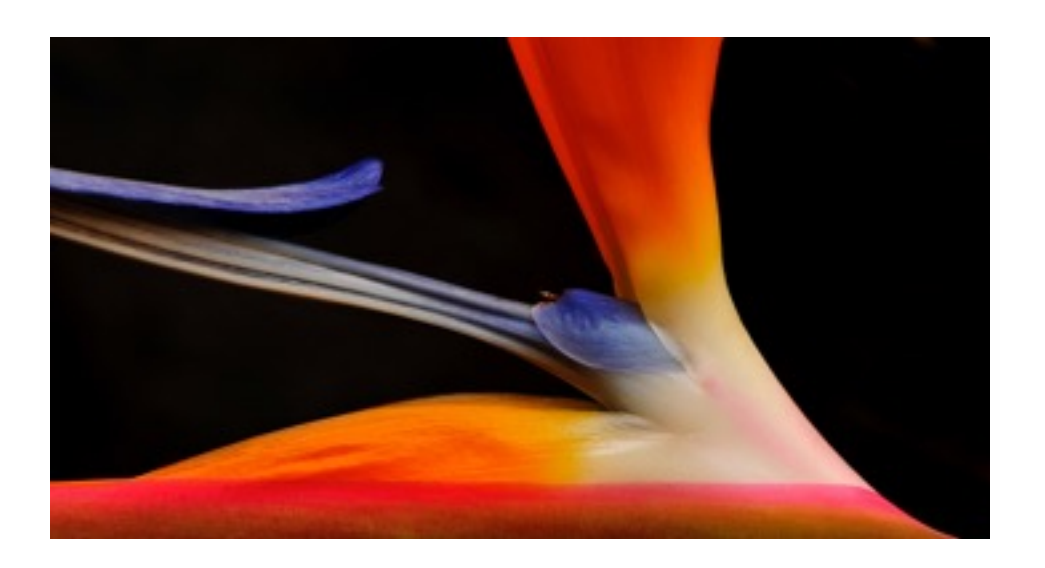
Judy's subject of flowers: 'Bird of Paradise"