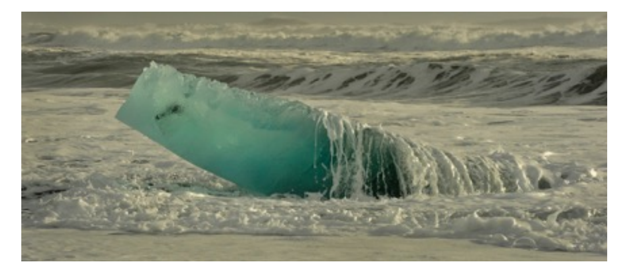
Judy's Landscape: 'Awash'