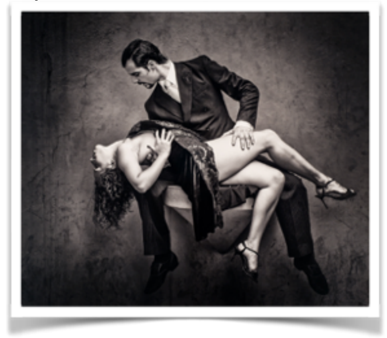
Champion Print 2014 The 46<sup>th</sup> Ballarat National Competition

Entry forms and further details will be made available as soon as possible.