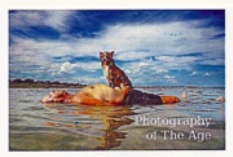
Newspaper photography in Australia from glass plate negatives to digital

If you have heard of some activity that may be of interest to members of the Club, or have some photographic equipment you would like to sell or advertise, please forward details (including contact phone number or email address) to the Flare editor and the items will be included in this section each month.