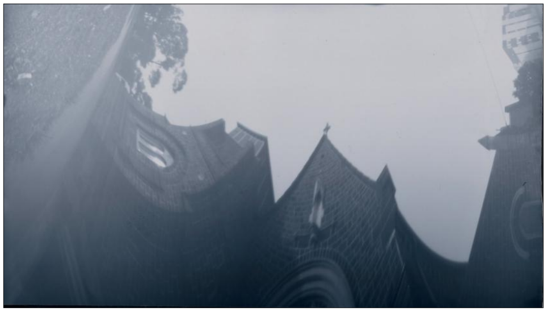
Pinhole positive and negative see "Worldwide Pinhole Photography Day"