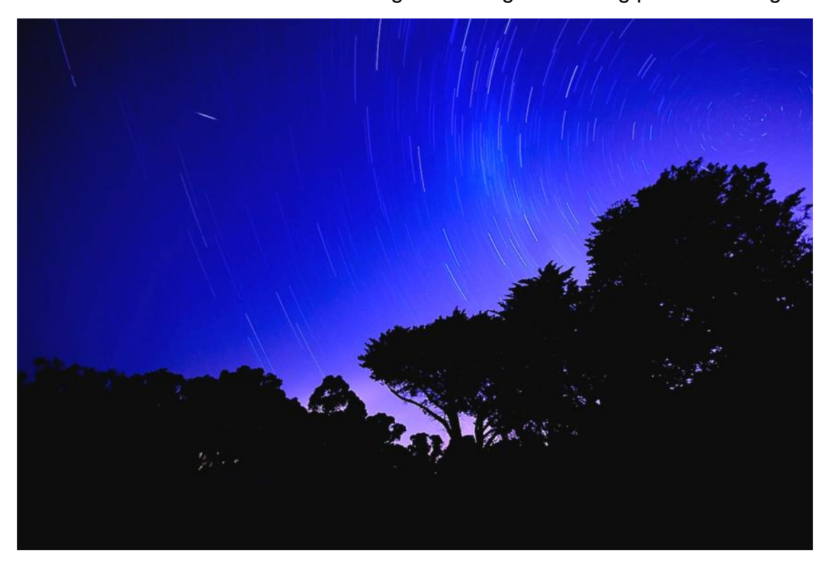
Nikon D200 Lens Wide Angle 10 – 20 mm at 10mm Manual Exposure @ F4.2 ISO 100 Manual Focus (set at Infinity) and Matrix Metering. Exposure time and in camera noise reduction 45mins.

This spot is a great place to try star trails as you can get the bridge in the foreground as you face true south. South facing star trails give you the best opportunity to get your trails heading in a circular pattern. If enough members are keen to do this again the committee will decide on a night and we can sort out our camera settings at the digital meeting prior to the night.