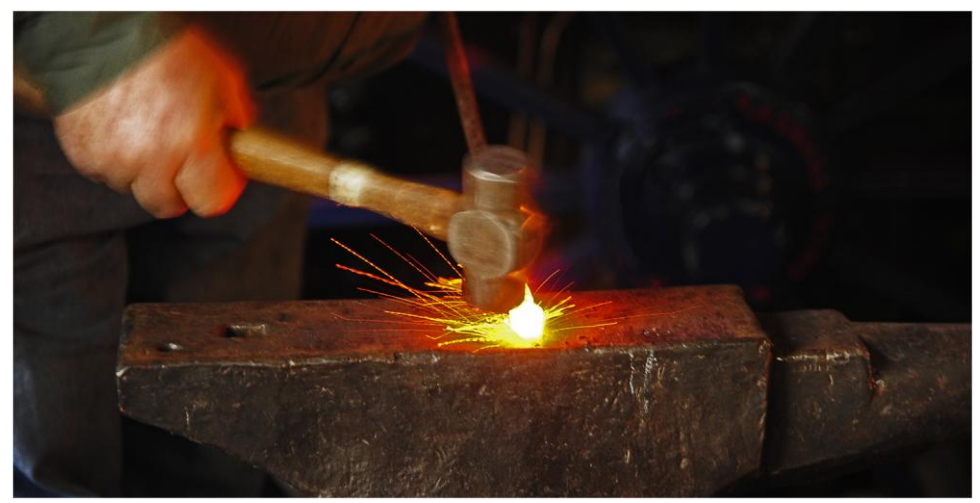
"At the Anvil"

Thanks to the committee for suggesting and organizing the day. All participants thoroughly enjoyed themselves.