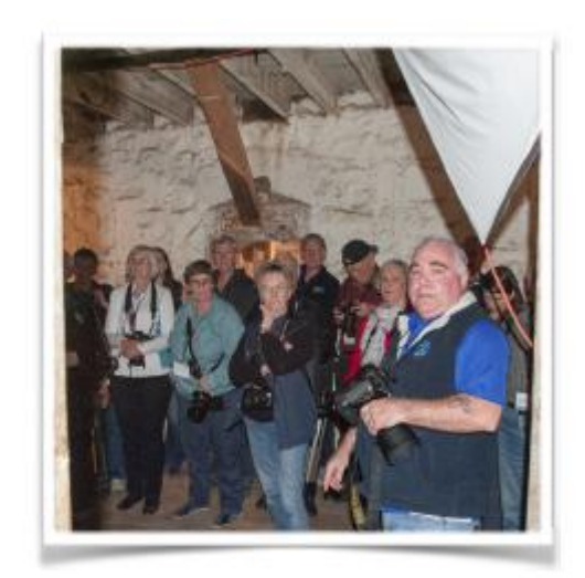
Andersons Mill Workshop