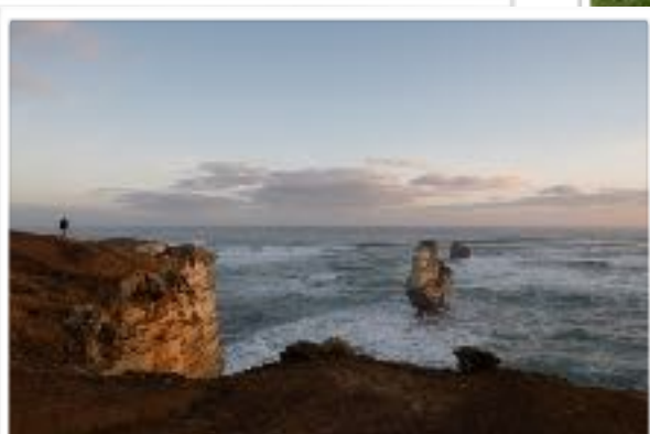
Some images from Peterborough

I have not organised an outing for June as we are still hoping to be able to visit Full Flight. It was suggested at the committee meeting that we visit Aradale asylum at Ararat for an